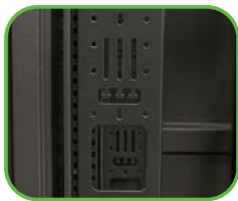
Vertical lacing channels pre-installed in rear corners for easy cable management