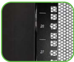
Square cage holes in standard EIA-310-D hole spacing and RU markings