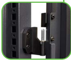
Quick release lift off hinges