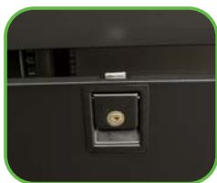
Removable and lockable half-height side panels