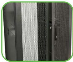
Standard configuration offers split mesh rear doors