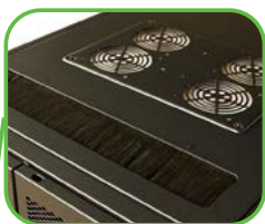
Cable access with air containment on top and bottom of cabinets