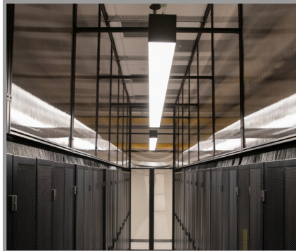
Aisle Containment Solutions