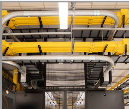
Cable Runway Systems