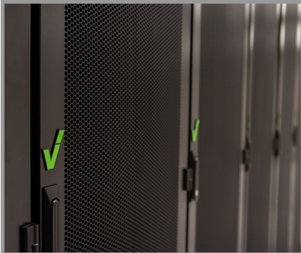
Network & Server Cabinets

The company needed a manufacturing partner with experience in planning, designing, and deploying network infrastructure and connectivity solutions for data center environments to carry out the project on time and within budget. Vericom was selected to engineer, produce, and supply turnkey, scalable solutions for its fully redundant data center.