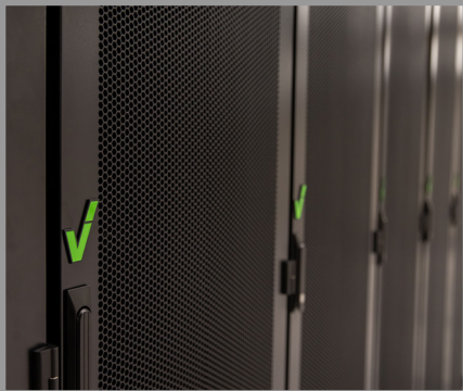
Network & Server Cabinets

The company needed a manufacturing partner with experience in planning, designing, and deploying network infrastructure and connectivity solutions for data center environments to carry out the project on time and within budget. Vericom was selected to engineer, produce, and supply turnkey, scalable solutions for its fully redundant data center.